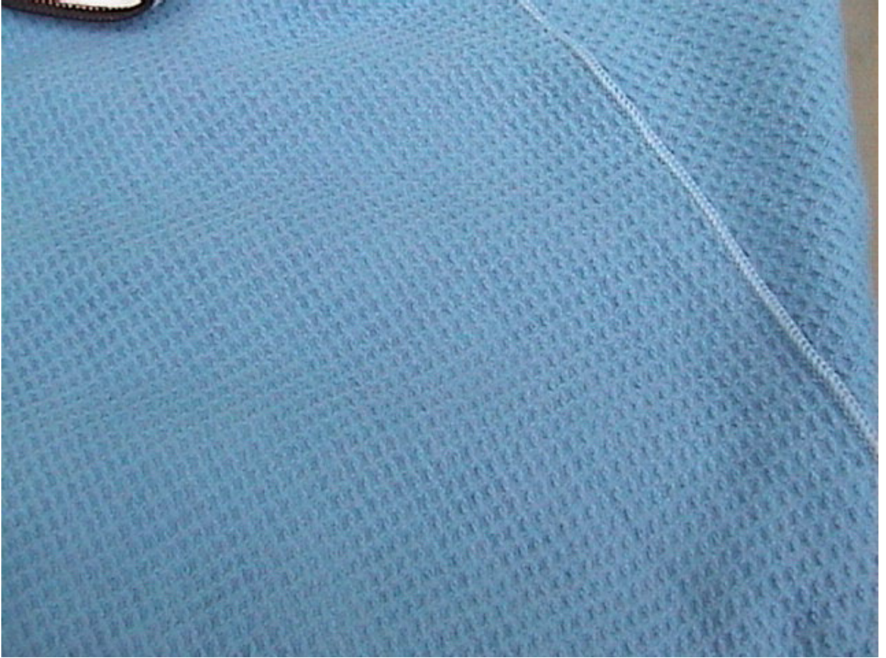
JT International Waffleweave microfiber towel