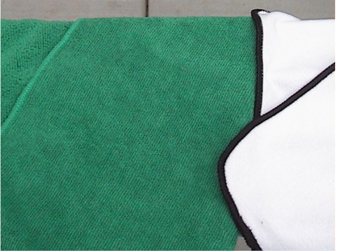
JT International on left Meguiar's ultimate wipe on right